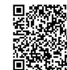
Kaboom Volunteer Registration