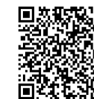
Blue's Clues Registration