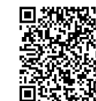
Xplosion Volunteer Registration